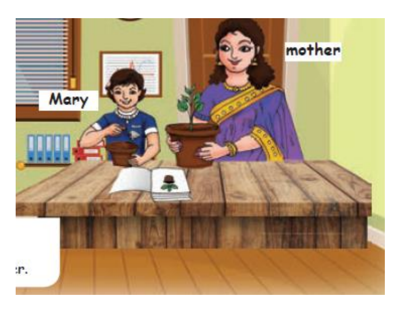
Figure 4 An example of the representation of the women and girls in Indian English (English Standard)

Although the characters in both textbooks are representing stereotypical national identities and promote urban lifestyles, Indian textbooks are more successful in keeping balance between urban and rural equality since they show their characters in a rural setting such as home or neighborhood. In addition, Indian textbooks encompass characters of various age groups whereas Iranian textbooks are portraying middle-aged adults and teenagers of both sexes (Figure 5).