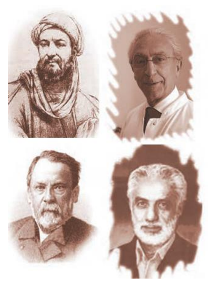
Figure 6 The only instance of portraying iconic figures in Prospect series (Prospect 2)

"other" iconic figure in this book is French rather than English. In addition, the "self" iconic figures are both historic and contemporary implying the long line of Iranian honored physicians and iconic figures in medicine. However, there is no more information about these figures than their names. Even their dates of birth and death (if any) are not mentioned. No biographical or professional profile or no short description, caption or narration is mentioned. No exercise, classroom activity or educational group work or project is dedicated to these figures. Within Kress and van Leeuwens' (1996) framework it can be argued that the pictures lack of close-up distance which promotes unfamiliarity and lack of closeness to the audience. Moreover, the pictures are not enjoying bottomup, but a horizontal perspective which promotes lack of their iconicity and their position as a role model for the audience of the textbooks (Figure 6).