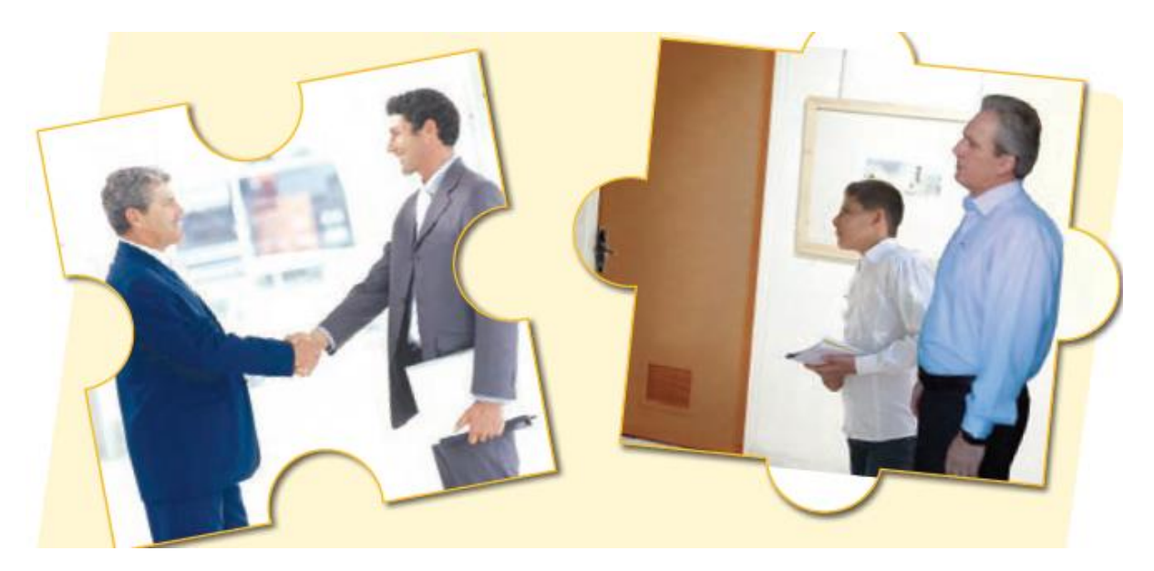
Figure 2 An example of representation of an Iranian man in Prospect series (Prospect 1)

The representation of men, women, children and teenagers in both Indian and Iranian school course books are similar in terms of showing a stereotypical appearance and identity. For example, in Iranian English textbooks a man is usually shown in business attire as if working in an official or governmental institution (Figure 2). From Kress and Van Leuween's (1996) perspective, both pictures in Figure 2, similar to many other is Prospect 1 o 3, are mid-shots which according to their model represent social relationships and are classified under analytical images, as shown in the pictures below.