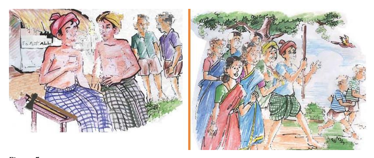
Figure 5 Examples of representations of rural Indian men and women in English Standard 3

Although the characters in both textbooks are representing stereotypical national identities and promote urban lifestyles, Indian textbooks are more successful in keeping balance between urban and rural equality since they show their characters in a rural setting such as home or neighborhood. In addition, Indian textbooks encompass characters of various age groups whereas Iranian textbooks are portraying middle-aged adults and teenagers of both sexes (Figure 5).