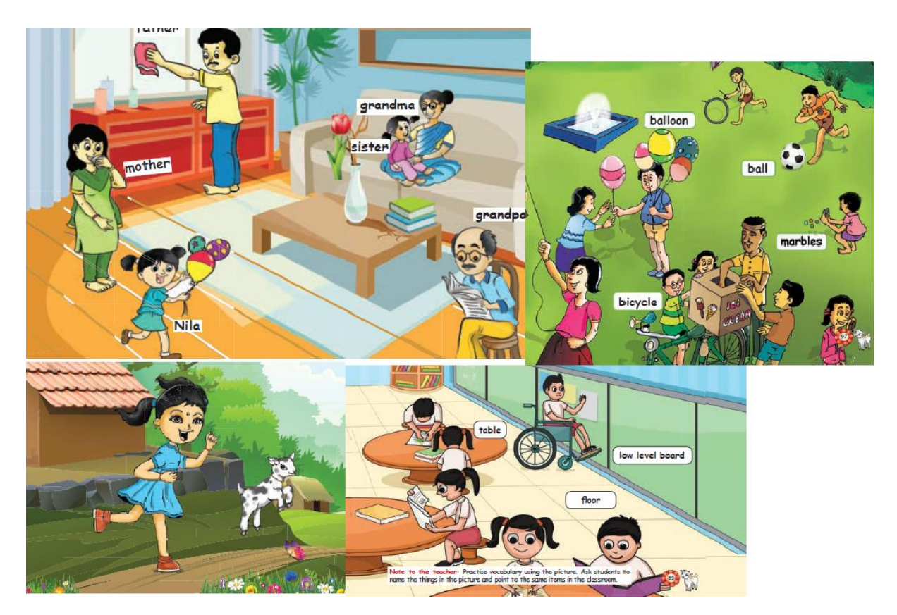
Figure 8 Instances of human relations in English Standard Series

The present study adopted a critical discourse analysis approach based on van Dijk's (1998, 2001) socio-cognitive model and Kress and van Leeuwn's (1996) meta-functional approach to investigate the representation of "Self" and "Other" in the English textbooks developed by the local authors for high schools in Iran and India. The overall finding of the study was that both textbooks weigh "Self" over "Other" so that there are almost no elements or components pinpointing otherness in these textbooks. That is, despite the existence of minor differences in these textbook series in terms of the manner of representing "Self", the ignoring and neglecting "Other" is a principle underlying developing the material in both settings.